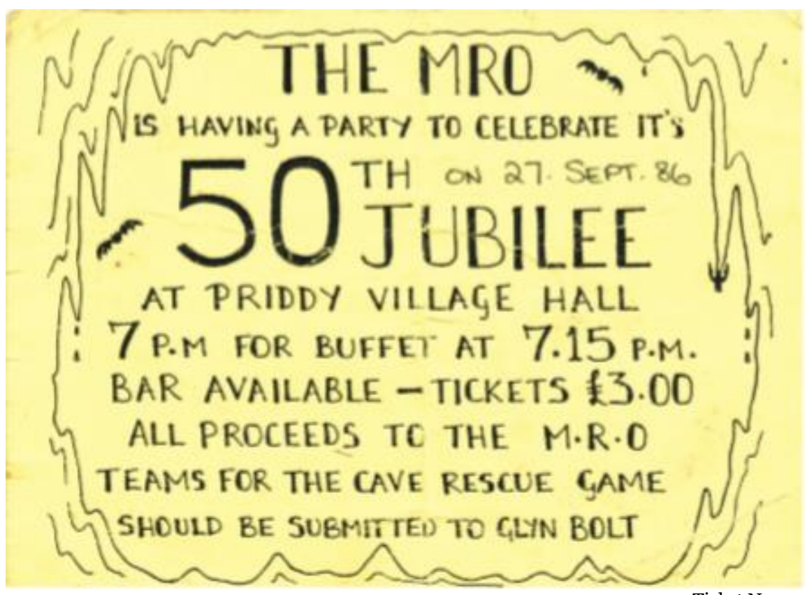
Ticket No. 22

Used two sevens and Ken James line reel to explore this huge resurgence; no plans to travel too far; high flow and cold conditions meant thirds reached around -23m. Effort to progress kept the diver warm-ish. A big place: a swift, uneventful exit.